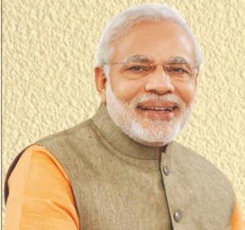
Narendra Modi Prime Minister